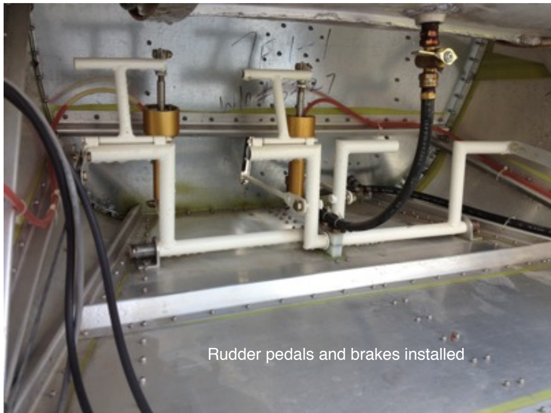
Rudder pedals and brakes installed