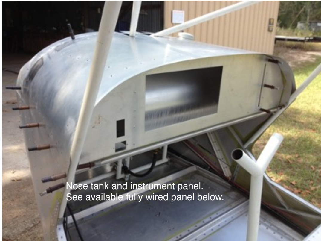
Nose tank and instrument panel. See available fully wired panel below.