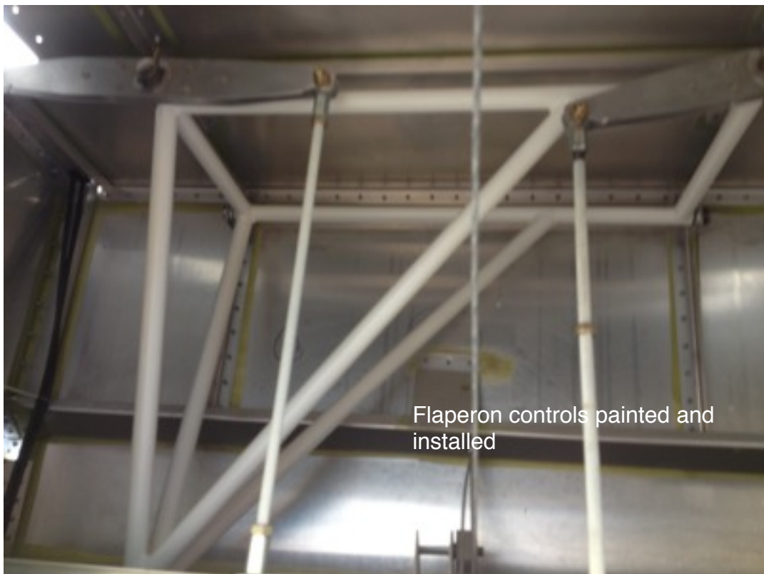
Flaperon controls painted and installed