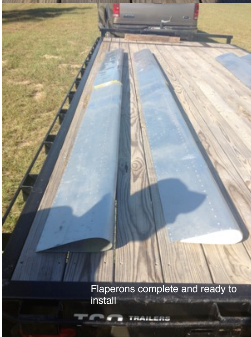
Flaperons complete and ready to install