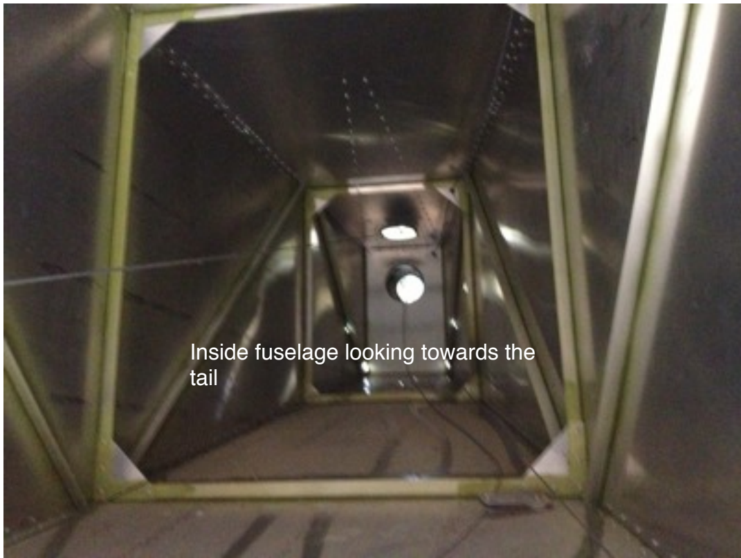
Inside fuselage looking towards the tail