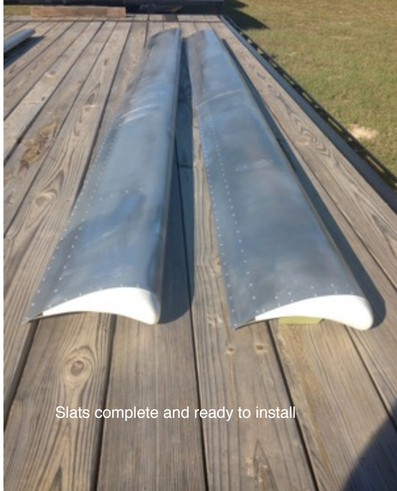
Slats complete and ready to install