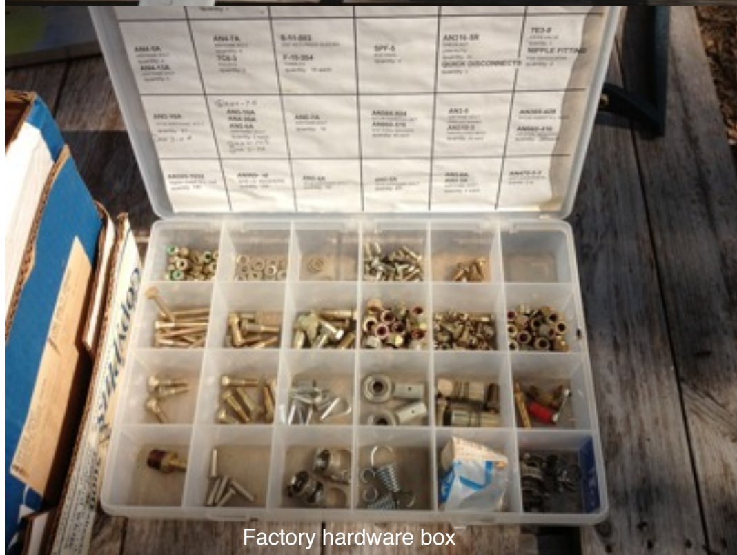
Factory hardware box